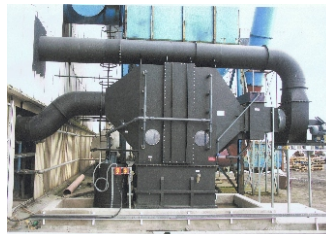
Large capacity fume scrubbing