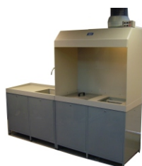
Cabinet with floor mounted tanks