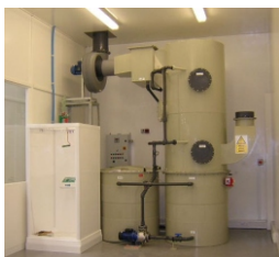
Cabinet with fume scrubbing